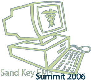
Exhibit and Sponsorship Opportunities