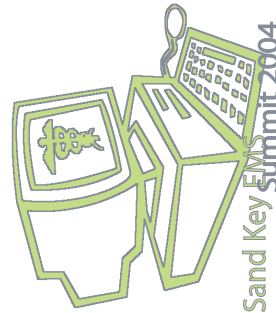
Exhibit Space Information & Fees

Exhibiting organizations assume full responsibility for their professional/personal property and obtaining insurance to protect against lost or stolen items.