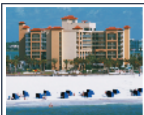
Sheraton Sand Key Resort