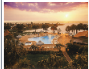
Clearwater Beach, FL