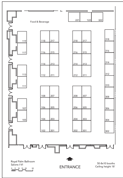
Exhibit and Sponsorship Opportunities