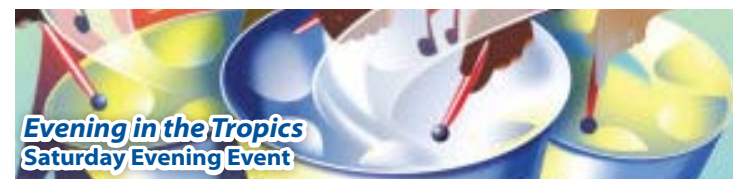
Evening in the Tropics Saturday Evening Event

Details: The lively and intoxicating sounds of the Caribbean Steel Drums are awaiting you poolside at The Naples Grande Resort Saturday, August 8 th from 6:00pm-7:30pm. Come enjoy light hors d'oeuvres at this year's Saturday evening event as you come alive to the island sounds of calypso, the driving beat of Brazilian samba and other tropical styles. Mark your calendar now with plans to attend an Evening in the Tropics!