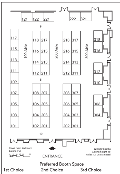
Exhibit and Sponsorship Opportunities