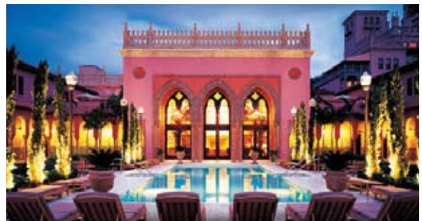
Private Pool at Spa Palazzo

EMLRC wishes to ensure no individual with a disability is excluded from the conference. If auxiliary aids or services are required in order to attend this program, notify EMLRC 15 days prior to the start of the conference.