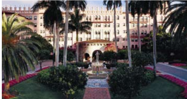
The Cloister at The Boca Raton Resort & Club