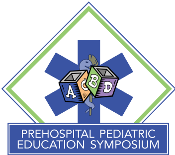
Exhibit Hall The Rosen Centre Hotel Salon 7 & 8