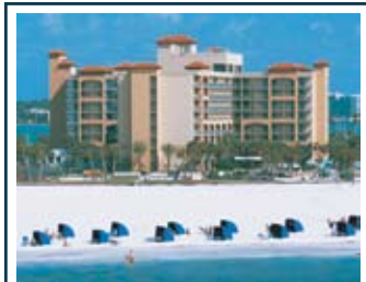
Sheraton Sand Key Resort

Faculty Disclosure The Florida Emergency Medicine Foundation adheres to ACCME standards regarding industry support of continuing medical education, and the disclosure of faculty and commercial sponsor relationships (if any) will be made known during the educational activity. Faculty are expected to openly disclose inclusion of discussion on any off-label, experimental or investigative use of drugs, devices, or equipment or any commercial sponsorship relations in their presentations.