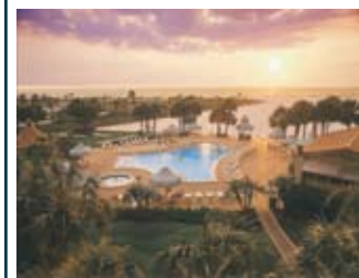
Clearwater Beach, FL