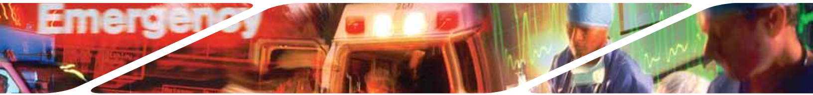
EXHIBIT HALL LAYOUT, DATES & HOURS